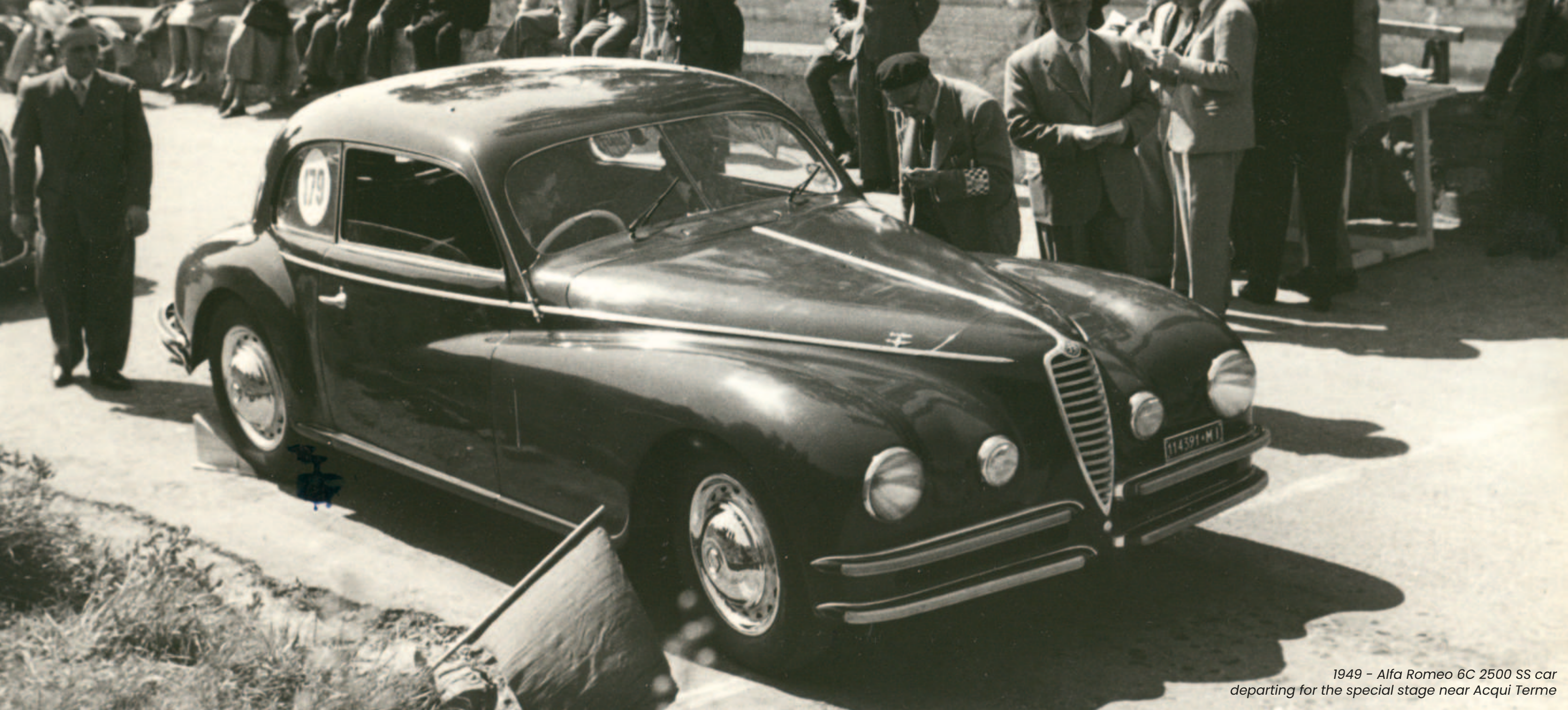
1949 - Alfa Romeo 6C 2500 SS car departing for the special stage near Acqui Terme